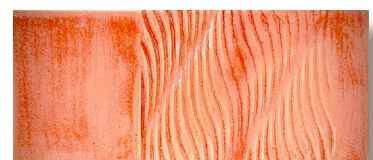
TD513 • Orange Neon