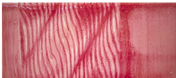
TD508 • Cherry Fizz