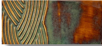
TD503 • Tidal Pool