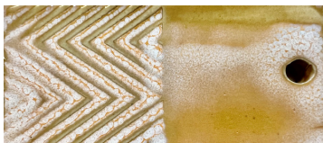
TD514 • Milk & Honey