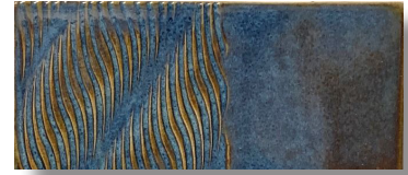
TD504 • Blue Dusk