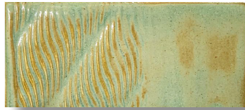
TD506 • Lichen Green