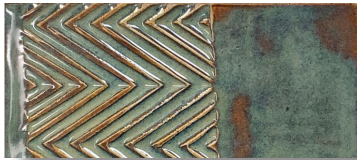
TD502 • Galaxy Blue