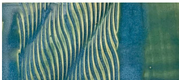
TD505 • Twilight Blue