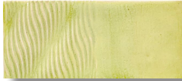
TD512 • Pistachio