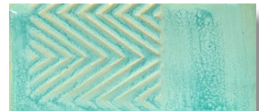
TD507 • Seafoam