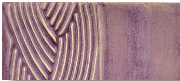
TD511 • Purple Velvet